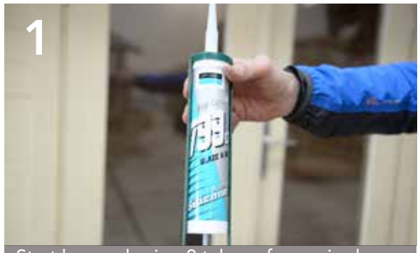
Start by purchasing 2 tubes of generic clear silicone sealant and an application gun. Only apply sealant after treating the cabin.