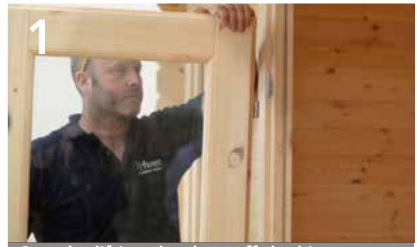
Start by lifting the door off the hinge.