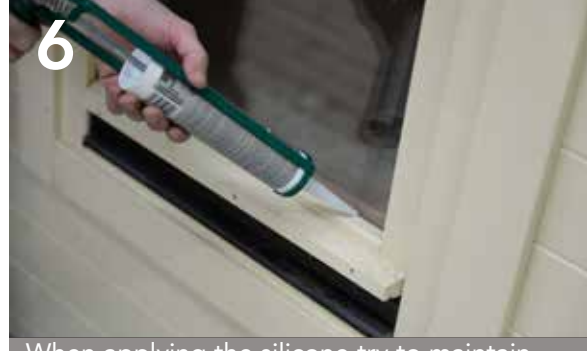
When applying the silicone try to maintain an even pressure on the applicator and use a smooth slow movement as you move the nozzle across the frame.