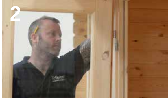
This will allow access to the adjusting bolt, located in the female part of the hinge attached to the door.