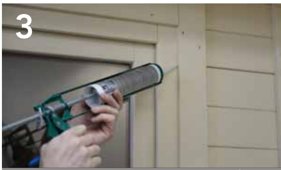
Apply the same technique to the inner frame.