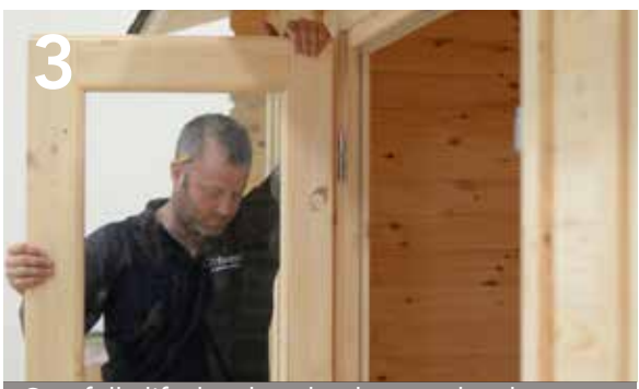
Carefully lift the door back onto the door frame hinge and check the adjustment. If further adjustment is required, lift the door back off the hinges and repeat the process as required.