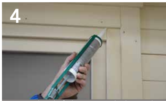
Ensure a bead of silicone is applied around the entire perimeter of the inner frame making contact with both edges of the frame to provide a seal.