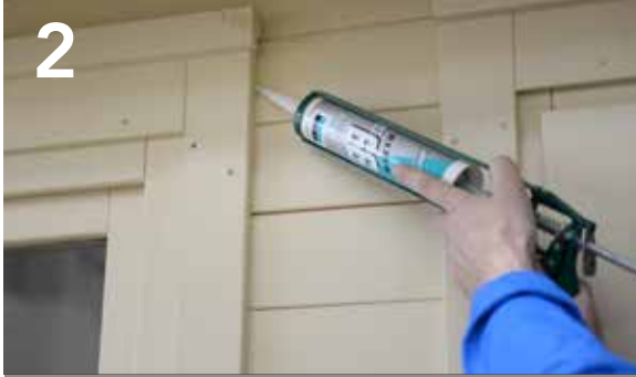
Seal around the outer perimeter of the frame where it meets the logs of the cabin. Always ensure the bead of silicone makes contact with the frame and cabin logs to provide a good seal.