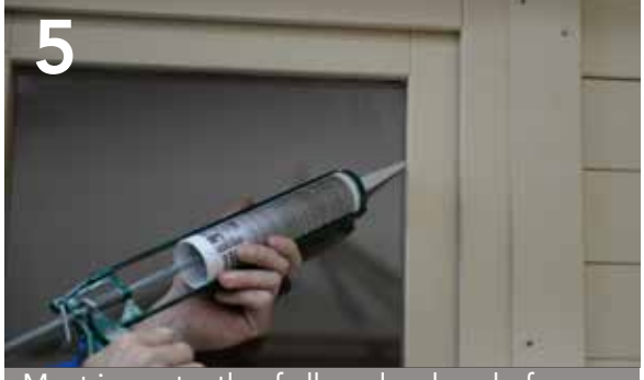
Most importantly of all apply a bead of silicone around the perimeter of the frame where it meets the glass.