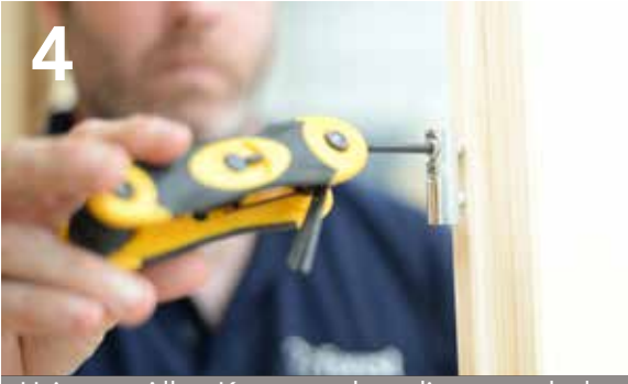
Using an Allen Key, turn the adjustment bolt anti-clockwise to push the door closer to the adjacent door, or turn it clockwise to pull the door back towards the door frame. Repeat with the bottom hinge as necessary.